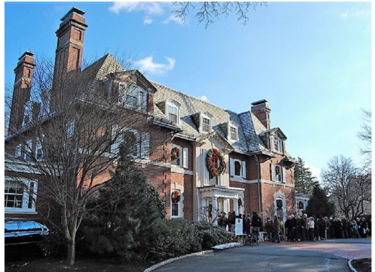
!!The Governor's Residence"

Remember to wear comfortable walking shoes