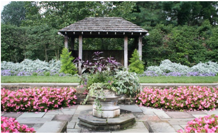
IMG_4928